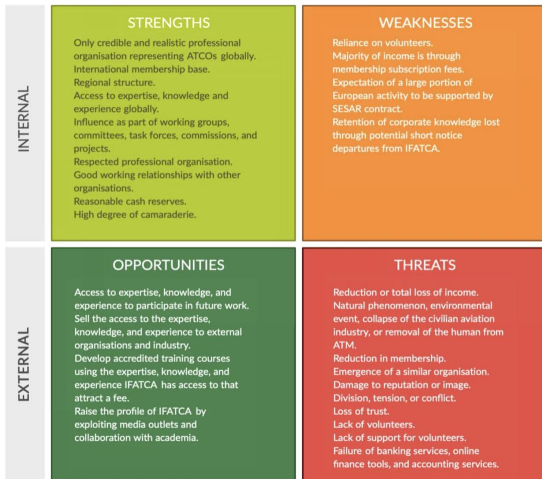
Figure 2: SWOT Analysis Diagram